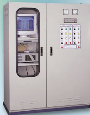
電氣控制單元 Electrical control panel