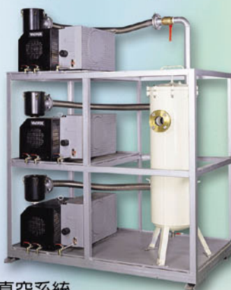
真空系統 Vacuum system