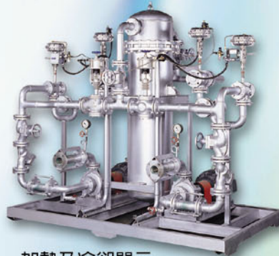
加熱及冷卻單元 Heating and cooling system